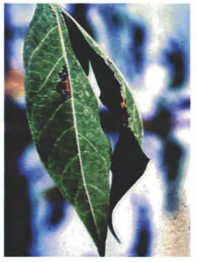
Figure 7: Cassava leaf with angular leaf spots of cassava bacterial blight