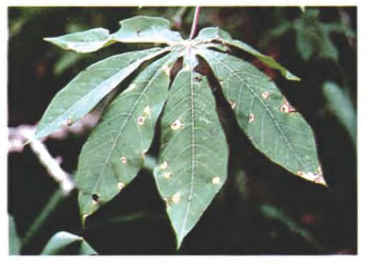
Figure 16: Cassava leaf with brown leaf spot disease