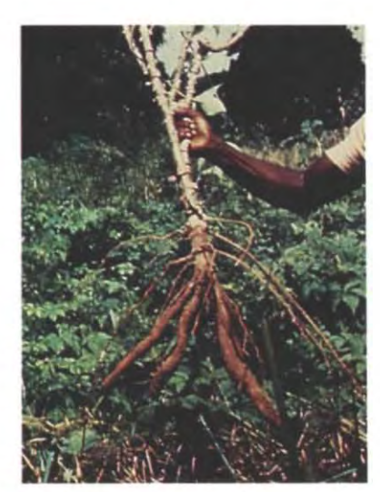
Figure 22: Poor cassava storage root yield