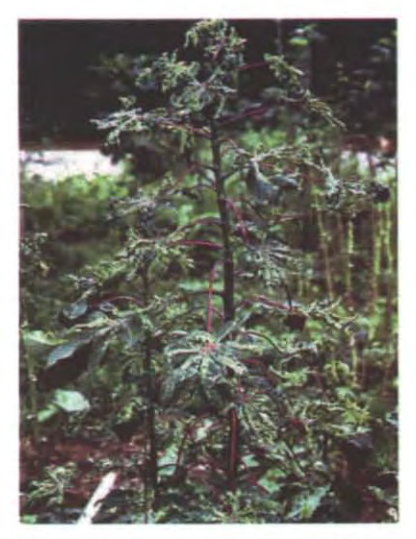
Figure I: Cassava plant damaged by cassava mosaic disease