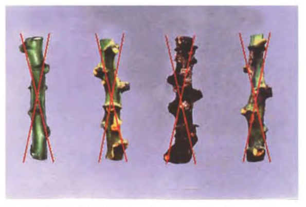
Figure 25: Unhealthy cassava stem cuttings