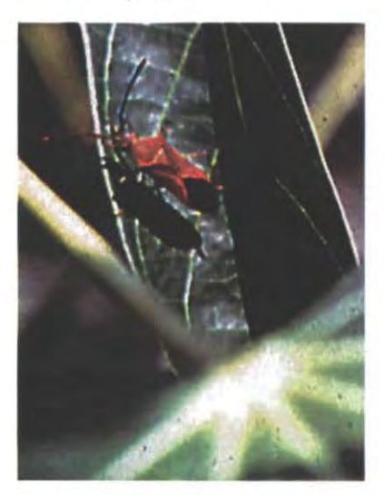
Figure 13: The bug Pseudotheraptus devastans on cassava leaf