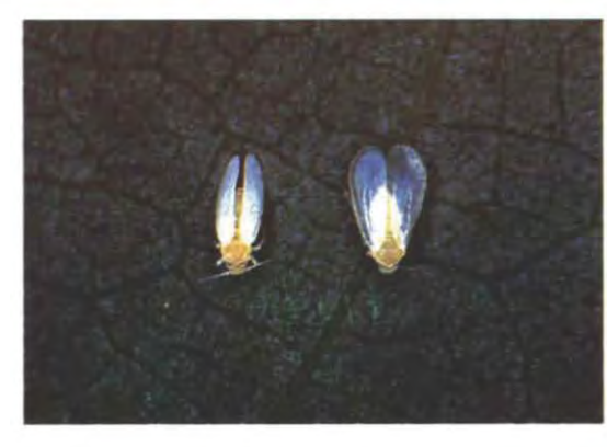
Figure 6: Adults of Bemisia whitefly (as seen enlarged under the microscope)