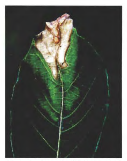
Figure 8: Cassava leaf blighting caused by cassava bacterial blight