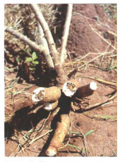
Figure 20: Cassava storage roots discolored by cassava brown streak disease