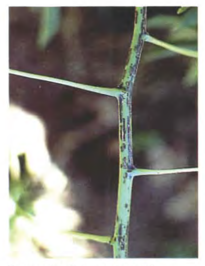
Figure 19: Cassava stem with "streaks" of cassava brown streak disease