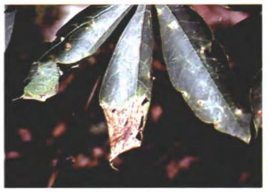
Figure 17: Cassava leaf with leaf blight disease