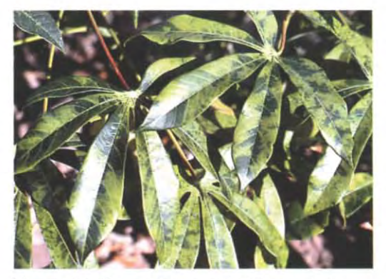
Figure 18: Cassava leaves with chlorotic (pale) patches of cassava brown streak disease