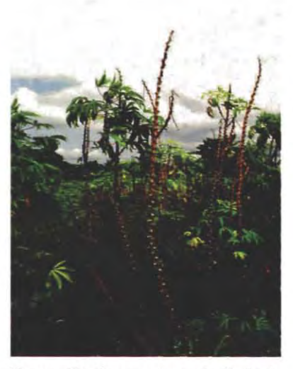
Figure 10: Cassava shoot tip die-back caused by cassava bacterial blight