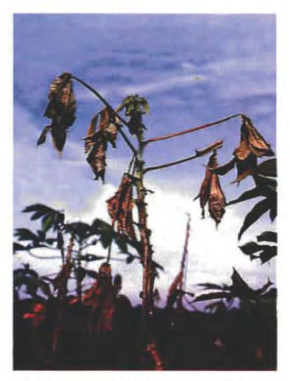
Figure 9: Leaf blighting and wilting caused by cassava bacterial blight