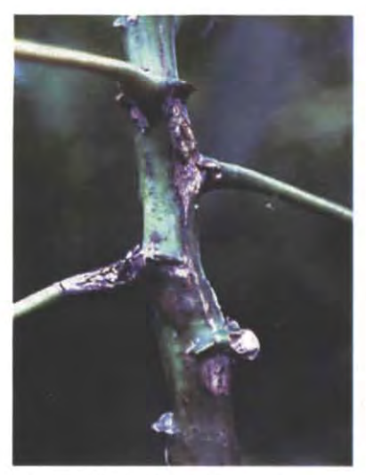
Figure 11: Cankers of cassava anthracnose disease at the bases of cassava leaf petioles