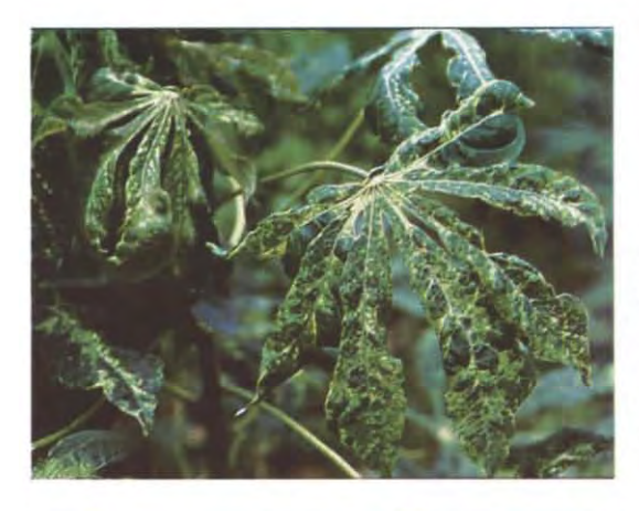
Figure 4: Cassava leaves with chlorotic (pale) patches of cassava mosaic disease