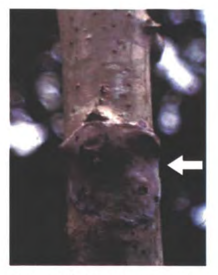
Figure 14: Cassava stem with fungal patch (arrow) of bud necrosis disease