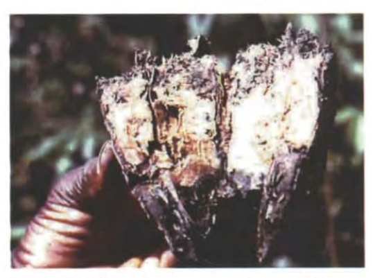
Figure 21: Cassava storage root destroyed by root rot disease