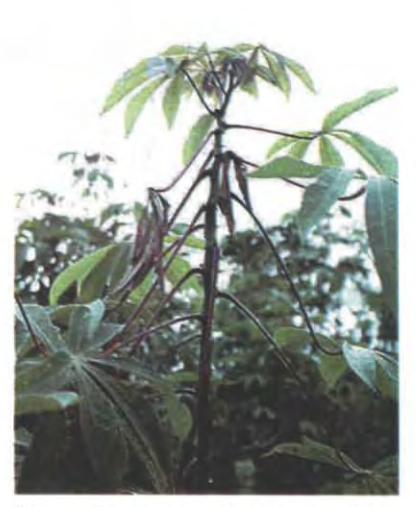
Figure 12: Cassava shoot with wilted leaves caused by cassava anthracnose disease