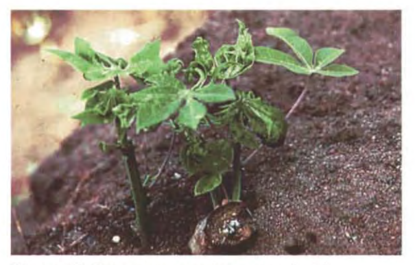
Figure 26: Cassava stem cutting sprouted with cassava mosaic disease