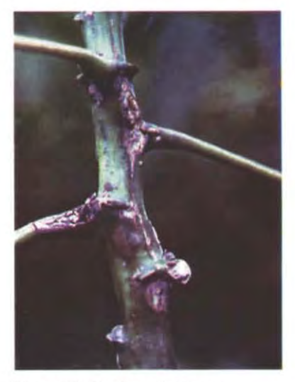
Figure 2: Cankers of cassava anthracnose disease on stem