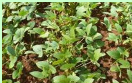
Soybeans without inoculation are pale and weak