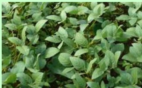
Inoculated soybeans are green and vigorous

NoduMax is produced at a modern facility at Ibadan, Nigeria using advanced technology. NoduMax is packed into boxes of 50 one-hundred gram packets for distribution through developmental and agrodealer networks