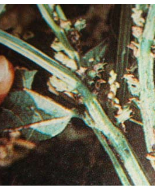
Figure 6b. Plant severely infested by thrips.