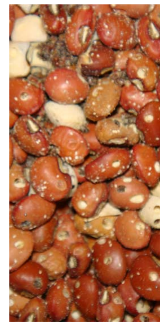
Figure 12. Poorly stored cowpea seeds (damaged by weevil).