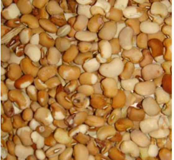
Figure 11b. Properly cleaned