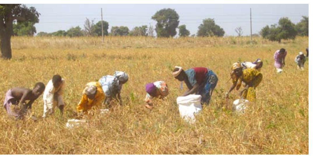
Figure 10. Harvesting mature pods of IT90K 277-2.