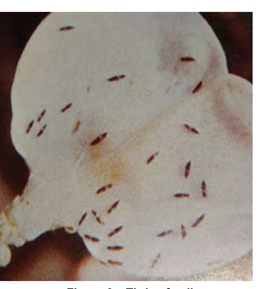
Figure 6a. Thrips feeding on cowpea flower.