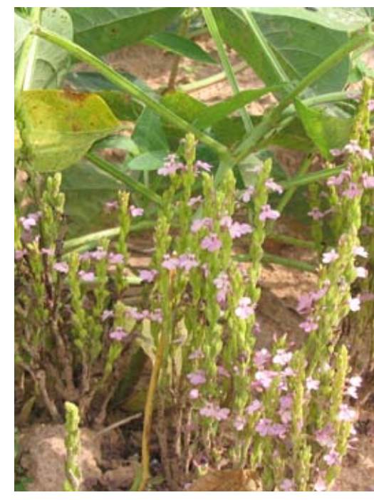
Figure 3. Striga gesnerioides parasitizing cowpea.

The seeds of these parasites can survive in soil for many years (more than 20 years) until a susceptible variety is planted. Cultural control measures that are affordable to farmers include cowpea–cereal rotation and the use of resistant cowpea varieties.