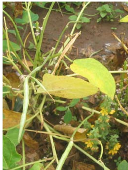
Figure 4. Alectra vogelii parasitizing cowpea.