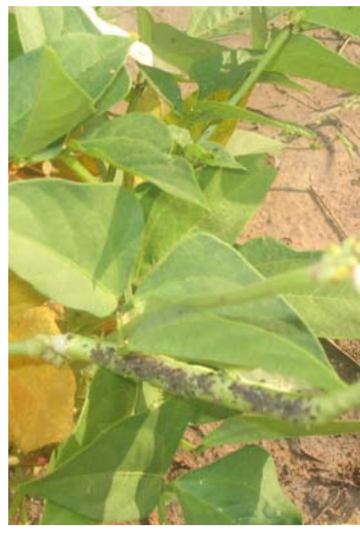
Figure 5. Aphid sucking sap from cowpea pod.

Insect pests are major constraints to cowpea production in West Africa. The crop is severely attacked at every stage of its growth by a myriad insects that