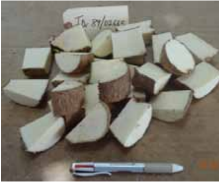
Figure 10. Freshly cut minisetts.

(e.g., ActForce gold: active ingredient is chlorpyrifos 48% EC) to prevent rots and damage by pests after planting. There are many types of chemical products available that could be used. If you are not sure which chemical and what quantity to use, an Agricultural Extension Officer in your locality will provide useful