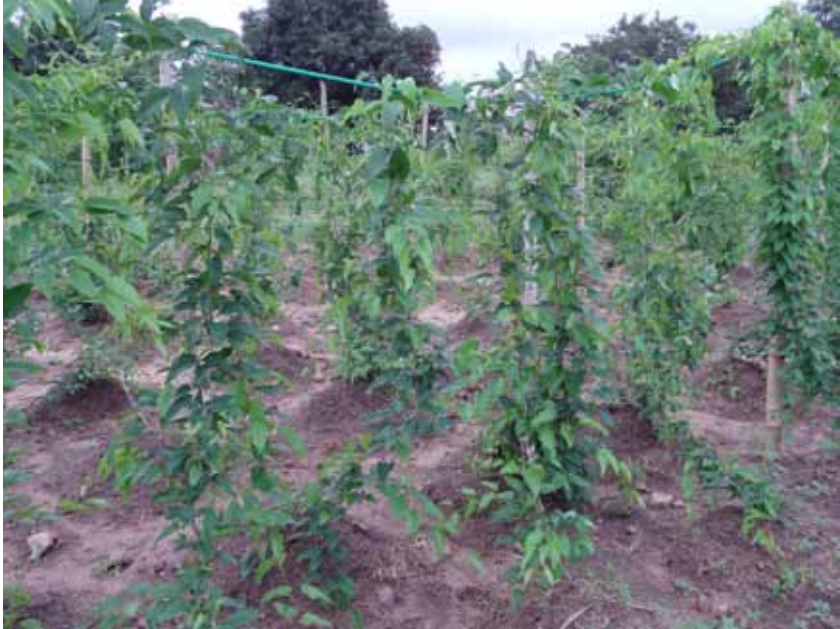
Figure 14. Staking seed yam plants with a trellis

the ridges and another pole or a rope is tied horizontally on top. Young yam vines are then directed to the horizontal pole with strings (Fig. 14). This is easily carried out when ridges or mounds are made in a straight line. Staked plants are better exposed to sunlight for enhanced photosynthesis and tuber yield. Staking also reduces the exposure of yam foliage to soil-borne diseases.