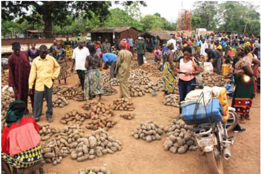
Yam market in West Africa.

using the minisett technique which provided the procedure from planting to harvest. However, the information is not detailed enough for the proper understanding and teaching of the principles involved. The manuals recommended the use of minisett dust (a mixture of fungicide, insecticide, and nematicide) for the chemical treatment of minisettts. The minisett dust is not readily available; this will not help in promoting the adoption of the technique if farmers do not know how or where to get the components.