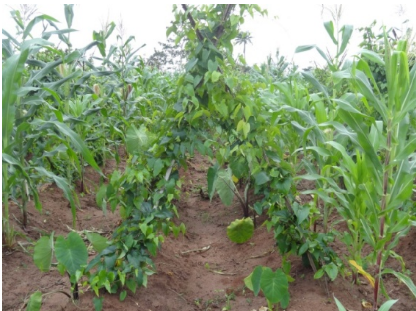
Figure 12. Seed yam intercropped with maize, cocoyam and cassava