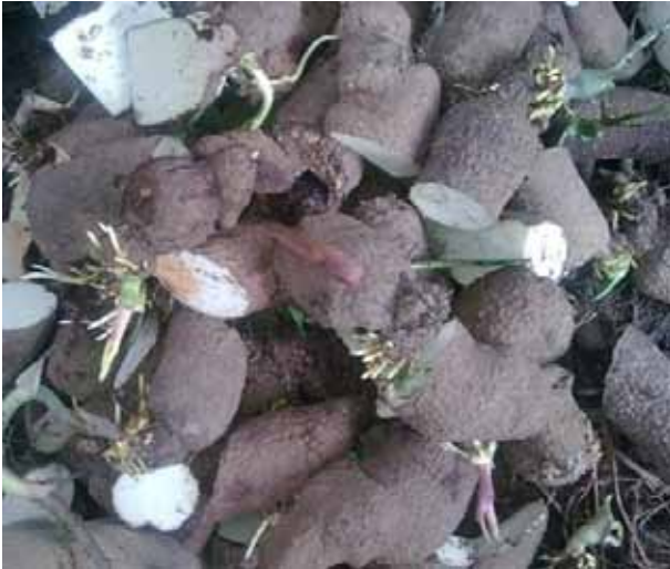
Figure 7. Cut setts weighing 300 - 500 g obtained from large tubers (junking).