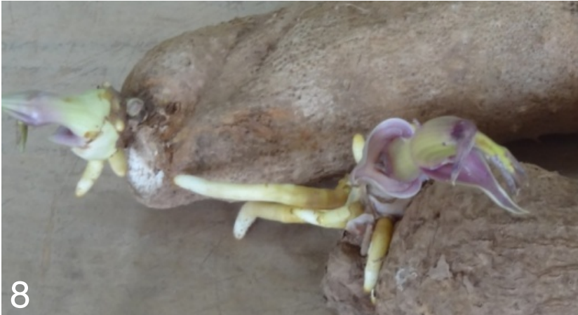
Figure 8. Sprouting of young tubers.