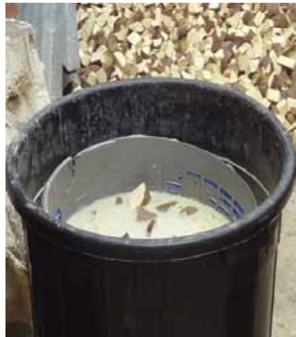
Figure 11. Treatment of minisetts in fungicide + insecticide solution.

In the absence of commercial chemical treatment, wood ash is used as a solution or dust. Ash with a high content of potassium, such as that obtained from burning the