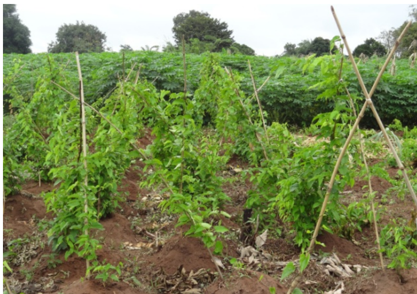
Figure 13. Pyramidal staking of a seed yam crop

Staking: In regions where yam is staked, plants from minisetts should also be staked. Since the plant foliage is smaller than that of ware yam, smaller stakes of 1-2 m will be adequate. Small sticks, split bamboos, or maize stalks can be used as staking material. Depending on the size, a stake can be placed against individual plants or several plants directed to a stake using strings; this is pyramidal staking (Fig. 13). Where stakes are not readily available, trellising can be done. Two poles are placed at the end of