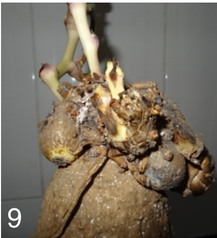
Figure 9. Tuberization of an old tuber in storage.

The young sprout is dependent upon the energy stored in the seed tuber for survival until it can generate a root system to source nutrients in the soil. Old seed tubers produce weak vines and plants that lack vigor due to the depletion of nutrients from multiple desprouting. The size of the sprout or vine on a seed tuber that has not been desprouted can more easily indicate the age of the tuber than where desprouting has been done several times in